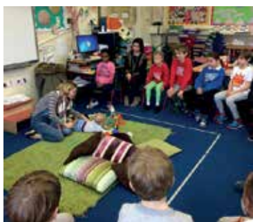
The parent and baby's interactions are observed by the children